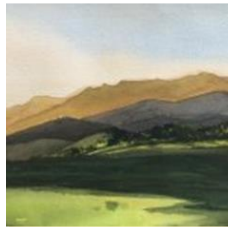
Centre Photos: Sydney Children's Hospital Exhibition